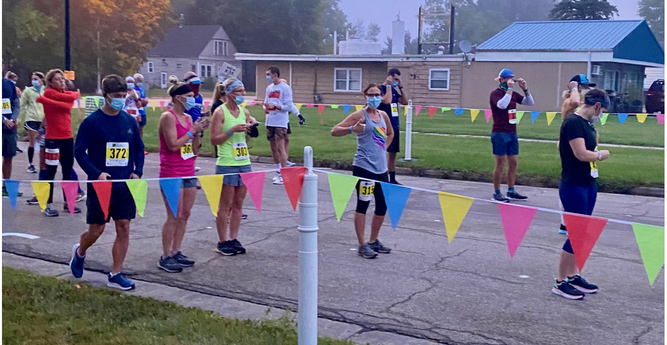
Brookings Marathon and Half Marathon runners find their dot on the street prior to the start of the 2020 race Sept. 12. Masks at the start line, distancing and temperature checks are expected to be part of this year's event as well.